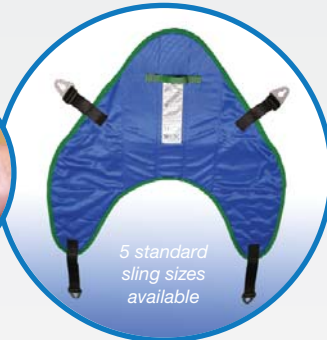
5 standard sling sizes available