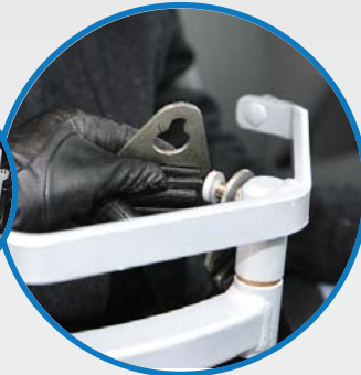
Easy to attach fixings