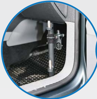
Mounting post in car, lift removed