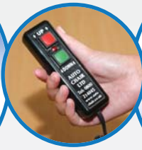
Simple hand control