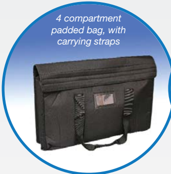
4 compartment padded bag, with carrying straps