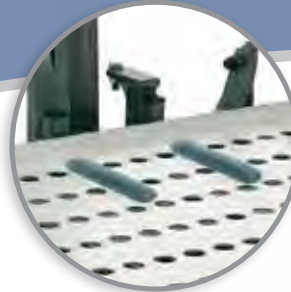
Standard adjustable wheel chocks

Note: Outlander Exterior Lifts can lift all of the listed scooters or power chairs with contoured, Synergy® or Specialty seating.