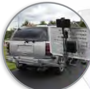
Optional swing-away adaptor