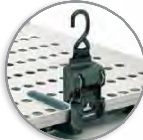
One-handed, black ratcheting straps