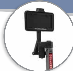
New standard license plate holder