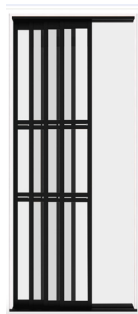
Clear Acrylic with Black Frame (Custom)