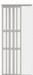
Clear Acrylic with Silver Frame (Standard)