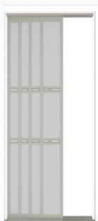
White with Silver Frame (Standard)